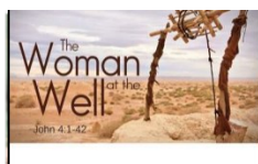
The Woman at the Well